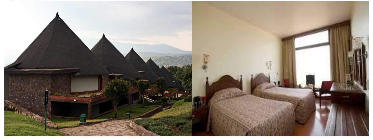
Day 13: Ngorongoro - Serengeti

Descend down the crater for a full day crater tour with lunch boxes. Dinner and overnight at Ngorongoro Sopa Lodge.