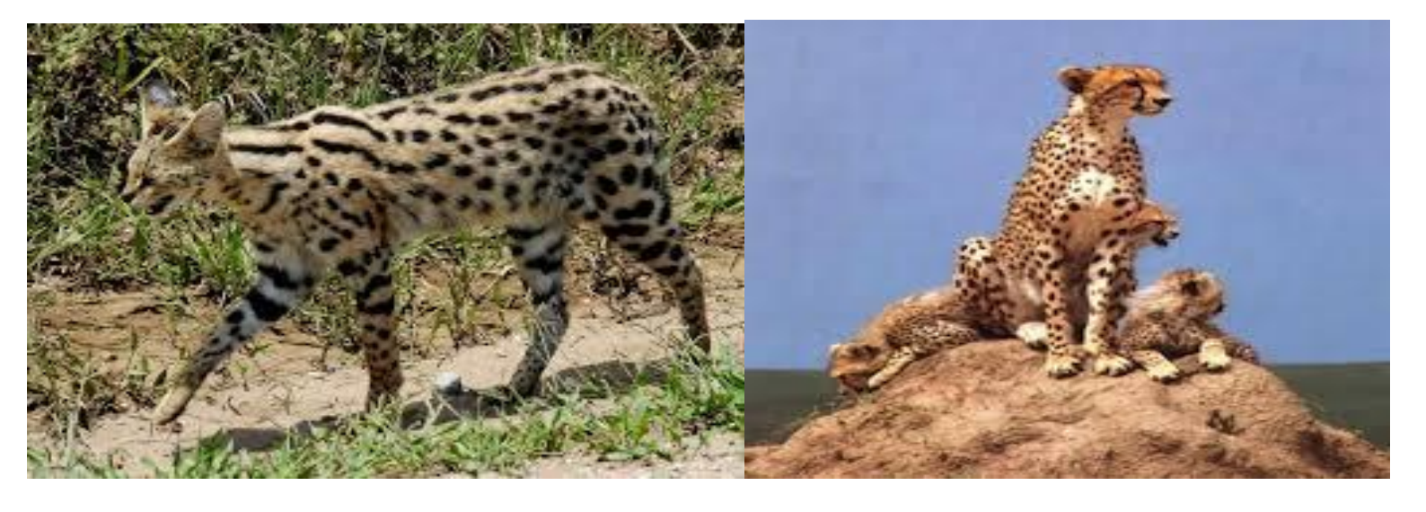
Day 14: Serengeti

After breakfast drive to Serengeti National Park Lunch at Serengeti Sopa Lodge. Afternoon game drive in Serengeti National Park . Dinner and overnight at Serengeti Sopa Lodge