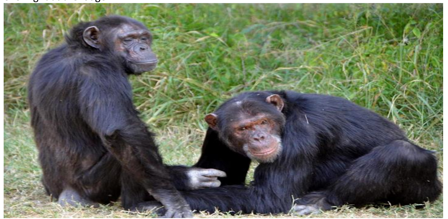
Day 4: Samburu

Leave Sweetwaters and drive North through the lush tea and coffee plantations of central Kenya and across the equator on the way to the Northern foothills of Mount Kenya, a 17,058-foot dormant volcano with glistening cap of ice and snow. Arriving in time for lunch at Ashnil Samburu Lodge in the grassland area which forms the bridge between Kenya's lush south and perched North. Dinner and overnight at the lodge.